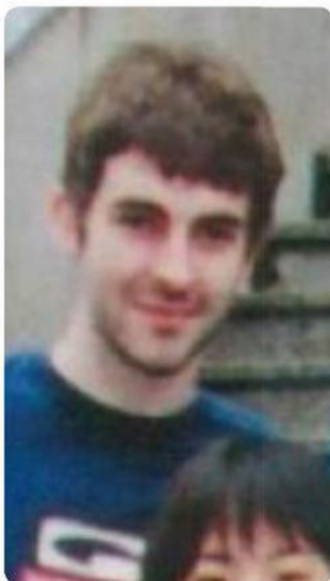
Photoed By: Year 2003