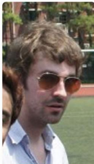
Photoed By: Year 2011