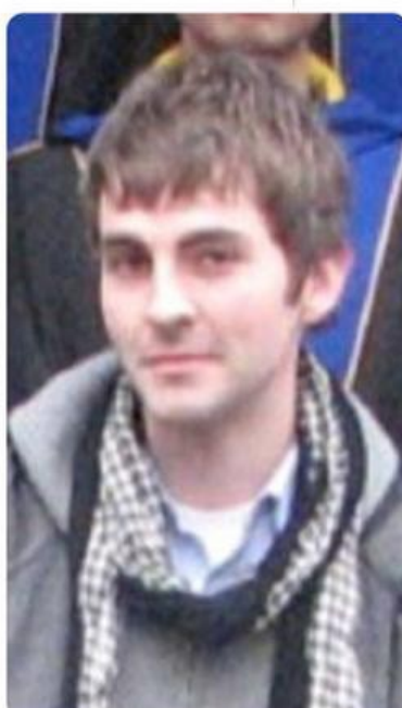
Photoed By: Year 2008