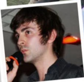
Photoed By: Year 2009